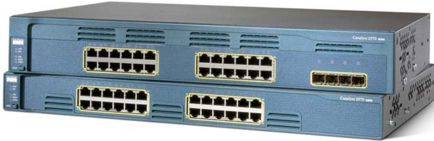
Figure 1. Cisco Catalyst 2970 Series Switches

The Cisco Catalyst 2970 Series is part of the industry's most complete range of stackable and standalone switches, including the Cisco Catalyst 2940, 2950, 2960, 3550, 3560, and 3750 Series Switches. Cisco's suite of fixed configuration switches provides Fast Ethernet and Gigabit Ethernet configurations with intelligent services to small and medium-sized businesses and enterprise branch offices.