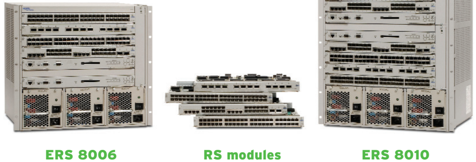
Figure 1. Nortel Ethernet Routing Switch 8600

All devices on the network need to ensure network element security as well as data integrity. The Ethernet Routing Switch 8600 employs several layers of built-in security for both switch access and network data. Nortel Secure Network Access v1.5 offers seamless secure access for internal end users (i.e., wired or wireless LAN networks) or external users. Firewalls, passwords, access policies, secure protocols, address and port filtering, routing policies and DoS prevention mechanisms help ensure that the network and its data stay secure.